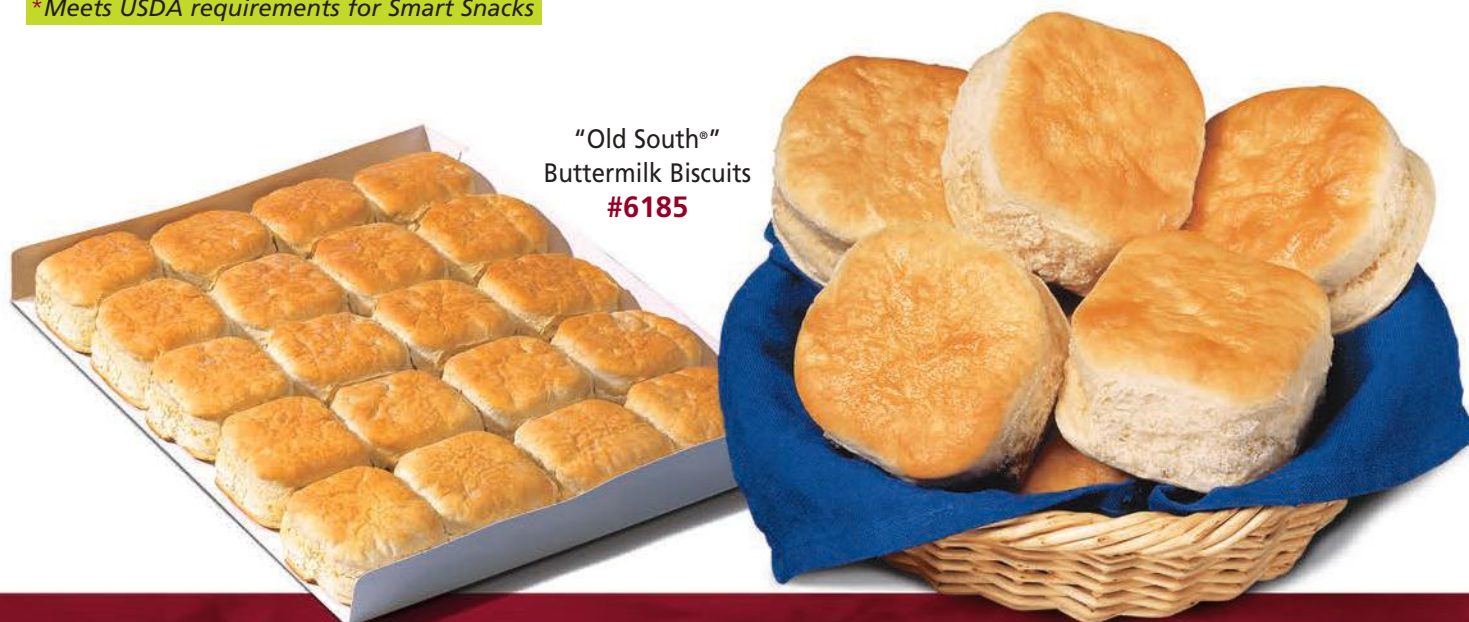
"Old South" Buttermilk Biscuits #6185

*Meets USDA requirements for Smart Snacks