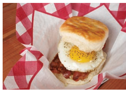
Egg & Bacon Biscuit Sandwich:

Slice or split and fill with a fried egg and crispy bacon.