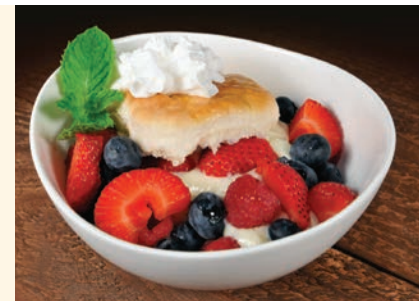
Berry Trifle: Fresh berries and creamy vanilla pudding, topped with a dollop of whipped cream.