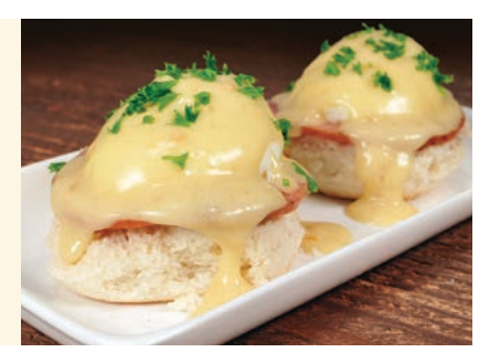
Biscuit Eggs Benedict: A delicious twist on the original.

For variety, top Bridgford "Old South®" Buttermilk Biscuits with country gravy, fresh berries, or easily split them open for delicious biscuit sandwiches! For more serving ideas, visit bridgford.com/foodservice. Happy Baking!