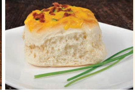
Bacon & Cheddar Biscuits: Top with Cheddar cheese,