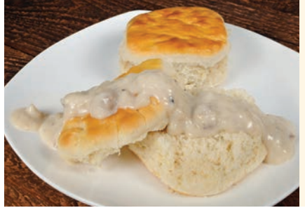
Top heated biscuits with gravy.